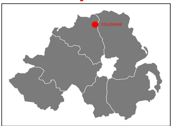
ALL MAPS ARE FOR IDENTIFICATION PURPOSES ONLY