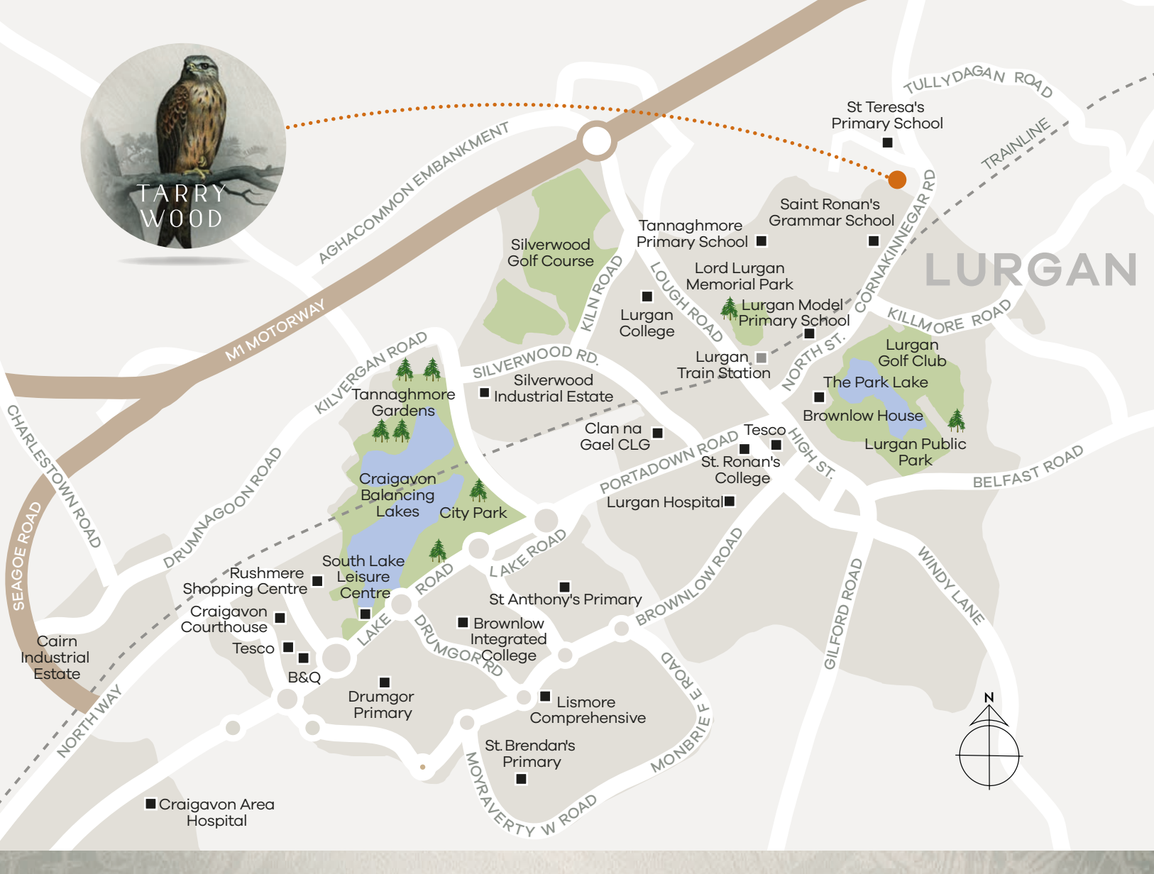
LOCATION MAP - NOT TO SCALE