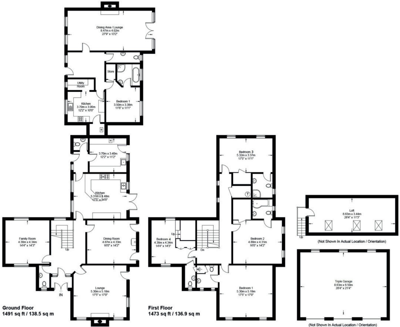
Illustration for identification purposes only, measurements are approximate, not to scale. FloorplansUsketch.com © 2023 (ID1011866)