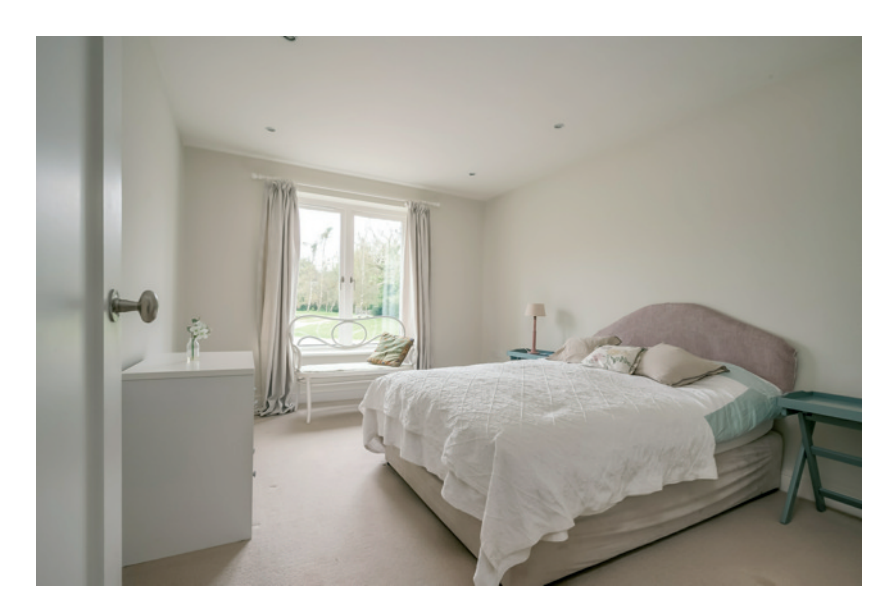
HOME OFFICE/BEDROOM (6): 12' 10" \times 10' 3" (3.91m \times 3.12m) (at widest points). Feature curved wall, low voltage spotlights.