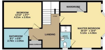
1ST FLOOR 599 sq.ft. (55.7 sq.m.) approx.