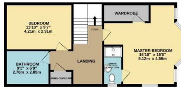
1ST FLOOR 599 sq.ft. (55.7 sq.m.) approx.