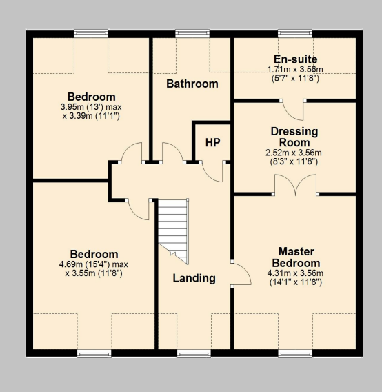
Please Note: Floorplans are for identification purposes only. Measurements are approximate and are taken using a laser measuring device.