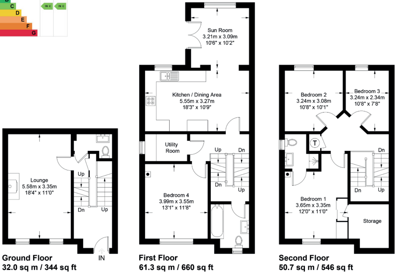
Illustration for identification purposes only, measurements are approximate, not to scale. (ID1013347)

The above details do not constitute any part of an offer or contract. None of the statements contained in this sales brochure is to be relied on as statements or representations of fact and any intending purchaser must satisfy himself by inspection or otherwise as to their correctness. Neither the vendor, nor Henry Graham Estate Agents, nor any person employed in the company has any authority to make or give any representation or warranty whatsoever in relation to this property. All dimensions are approximate and are taken at widest points.