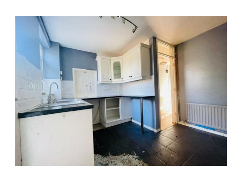
13 Manse Terrace Offers Over £69,950 Carnmoney Road North, Newtownabbey, BT36 5UJ

We are delighted to offer for sale this mid terrace which is located in a very popular residential area just off Carnmoney Road North.