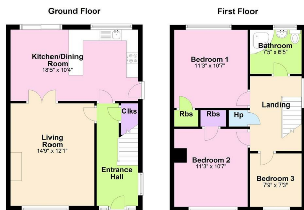
31 Rademon Drive, Crossgar

Terms & Conditions: Please note that these particulars do not constitute an offer or contract of sale. Any prospective purchaser should satisfy themselves by thorough inspection of the property and we recommend that any prospective purchaser should employ the professional services of a building surveyor and consider their findings prior to entering into contract. All such fees associated with this work will be the responsibility of the prospective purchaser regardless of whether the sale completes or not. In addition, none of the appliances or installations have been tested in any way whatsoever and it is our recommendation that a purchaser should fully satisfy themselves by employing an appropriate expert. We would also like to advise that our measurements are taken from the widest points of each room and should not be relied upon as completely accurate. You should not make decisions based on the measurements provided and double check measurements at all times. Valuation/Mortgage Service: As part of our service we would remind Vendors and potential purchasers that we have a Mortgage Broker available at this branch. If you are thinking of selling, we would be happy to carry out a free market appraisal of your property.