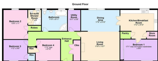
9 Killard Square, Ballyhornan

Terms & Conditions: Please note that these particulars do not constitute an offer or contract of sale. Any prospective purchaser should satisfy themselves by thorough inspection of the property and we recommend that any prospective purchaser should employ the professional services of a building surveyor and consider their findings prior to entering into contract. All such fees associated with this work will be the responsibility of the prospective purchaser regardless of whether the sale completes or not. In addition, none of the appliances or installations have been tested in any way whatsoever and it is our recommendation that a purchaser should fully satisfy themselves by employing an appropriate expert. We would also like to advise that our measurements are taken from the widest points of each room and should not be relied upon as completely accurate. You should not make decisions based on the measurements provided and double check measurements at all times. Valuation/Mortgage Service: As part of our service we would remind Vendors and potential purchasers that we have a Mortgage Broker available at this branch. If you are thinking of selling, we would be happy to carry out a free market appraisal of your property.