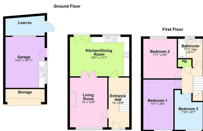
49 Church View, Ballynahinch

Terms & Conditions: Please note that these particulars do not constitute an offer or contract of sale. Any prospective purchaser should satisfy themselves by thorough inspection of the property and we recommend that any prospective purchaser should employ the professional services of a building surveyor and consider their findings prior to entering into contract. All such fees associated with this work will be the responsibility of the prospective purchaser regardless of whether the sale completes or not. In addition, none of the appliances or installations have been tested in any way whatsoever and it is our recommendation that a purchaser should fully satisfy themselves by employing an appropriate expert. We would also like to advise that our measurements are taken from the widest points of each room and should not be relied upon as completely accurate. You should not make decisions based on the measurements provided and double check measurements at all times. Valuation/Mortgage Service: As part of our service we would remind Vendors and potential purchasers that we have a Mortgage Broker available at this branch. If you are thinking of selling, we would be happy to carry out a free market appraisal of your property.