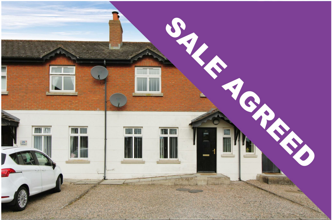
23 Mill Green, Doagh, Ballyclare, BT39 0PH