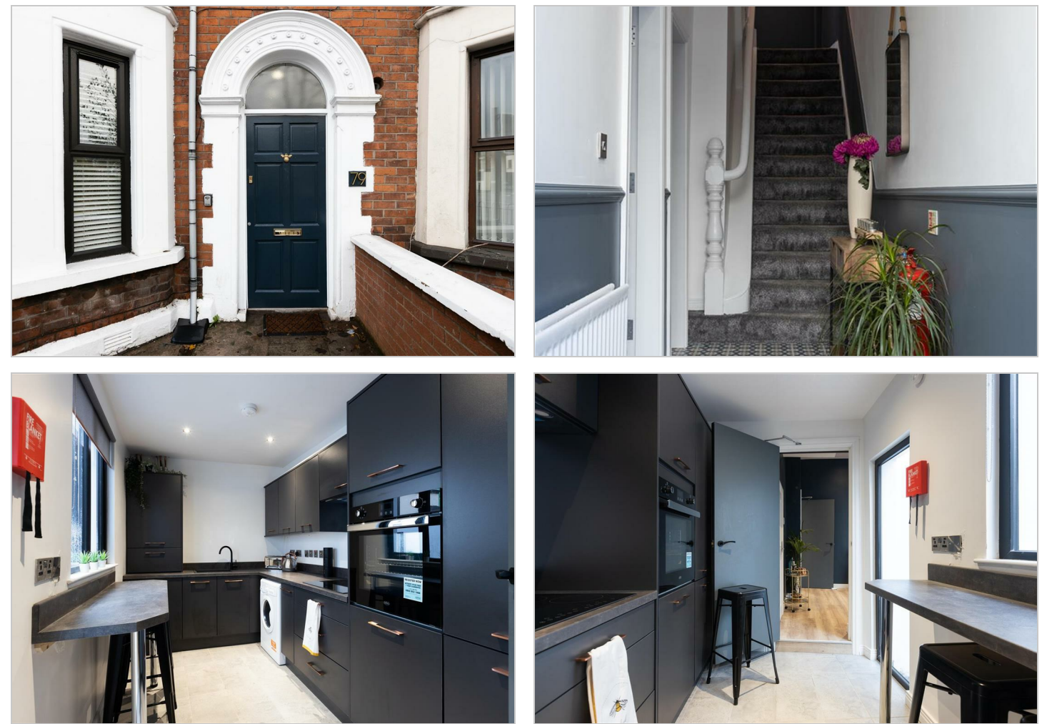
These particulars, whilst believed to be accurate are set out as a general outline only for guidance and do not constitute any part of an offer or contract. Intending purchasers should not rely on them as statements of representation of fact, but must satisfy themselves by inspection or otherwise as to their accuracy. No person in this firms employment has the authority to make or give any representation or warranty in respect of the property.