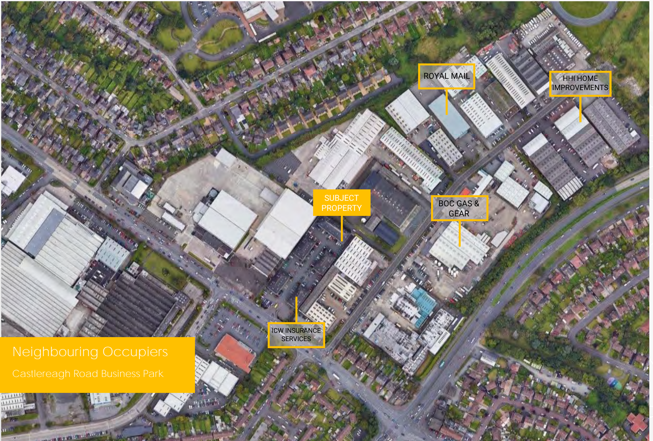
Neighbouring Occupiers Castlereagh Road Business Park