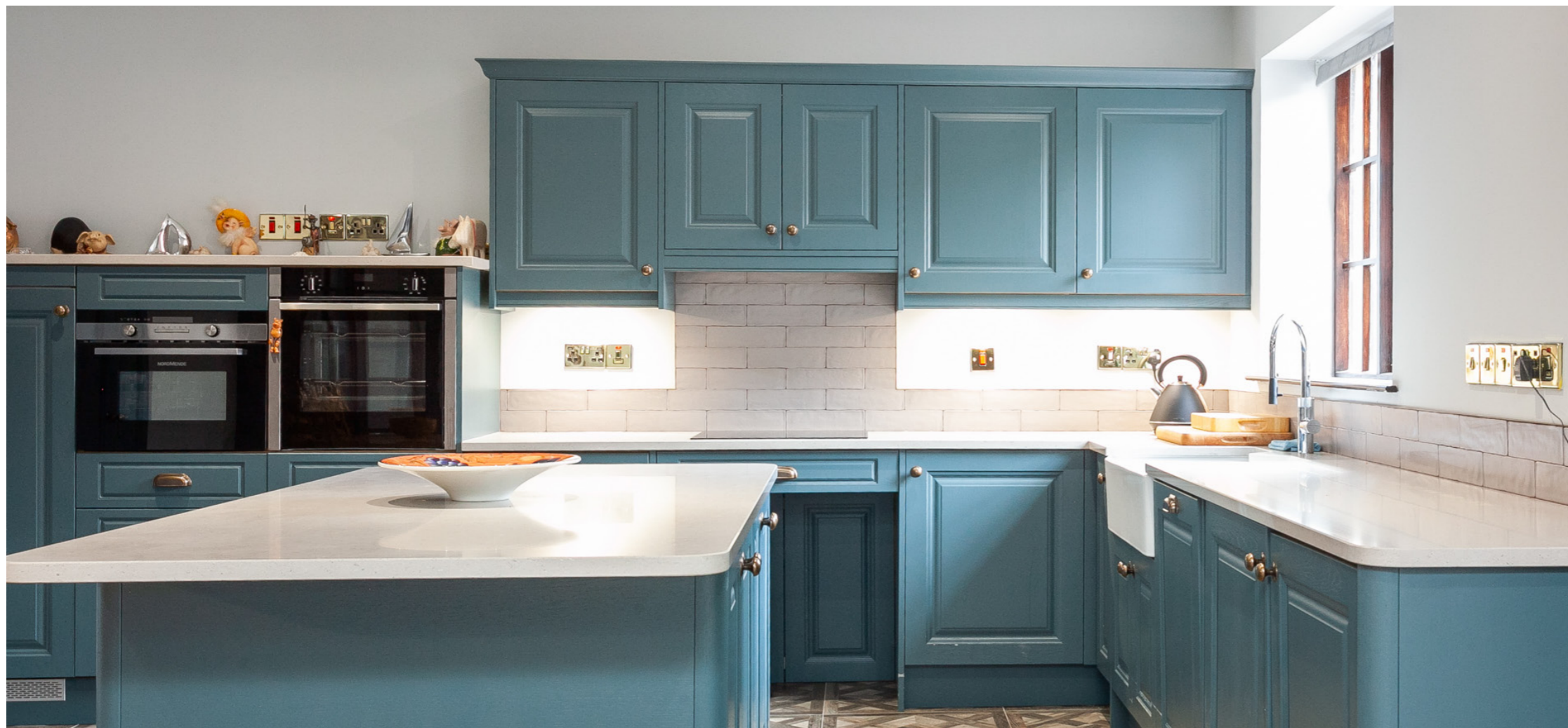
Luxury kitchen with breakfast area