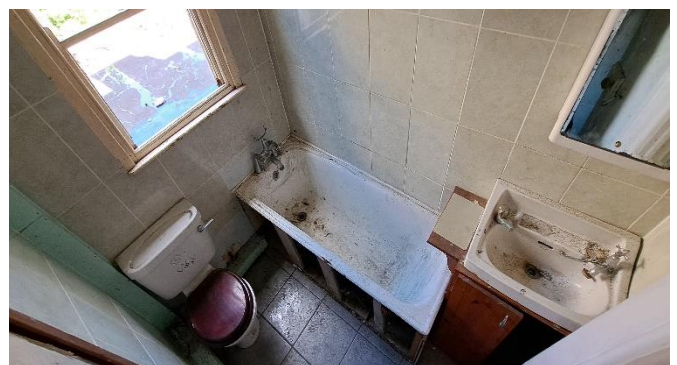
First floor Bathroom: 1.5m x 2.2