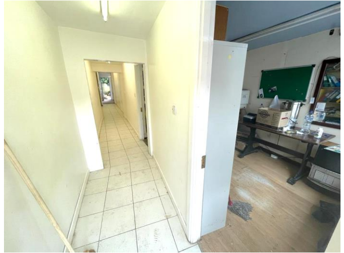
First floor sitting room: 3m x 4.8m