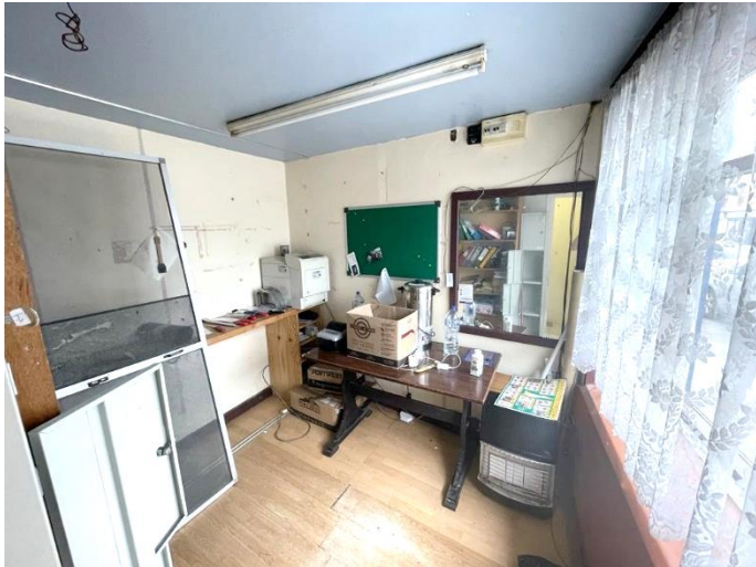
First floor Bedroom: 3.2m x 3.0m