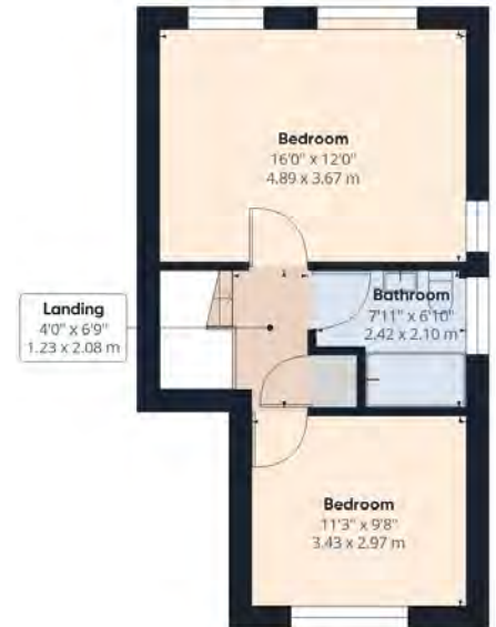
Floor 1 Building 1