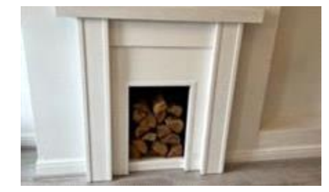
Two bedroom mid terraced house in prime loaction