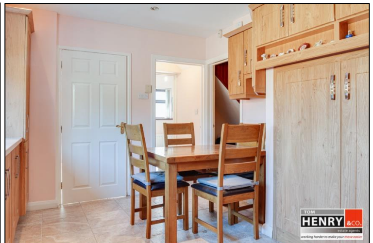
REAR LOBBY: TILED FLOOR. U.P.V.C EXTERNAL DOOR WITH GLAZED TOP PANEL.