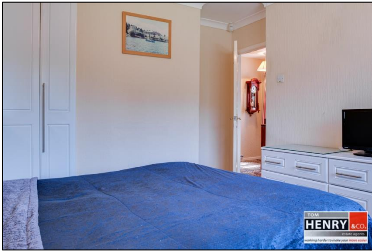
BEDROOM 2: TO REAR. CARPET TO FLOOR.