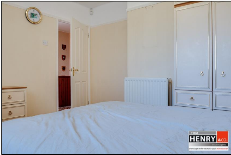
BEDROOM 3: TO FRONT. BUILT-IN CUPBOARD.