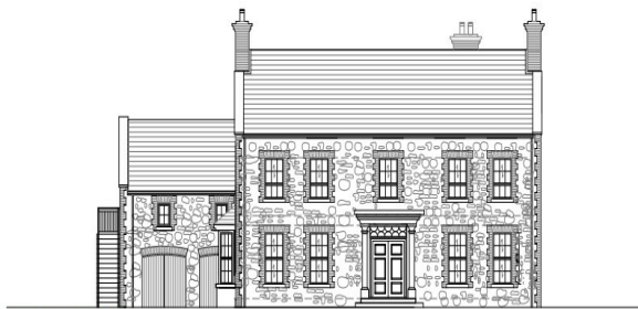
FRONT (NORTHWEST) ELEVATION