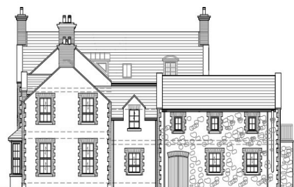
REAR (SOUTHEAST) ELEVATION