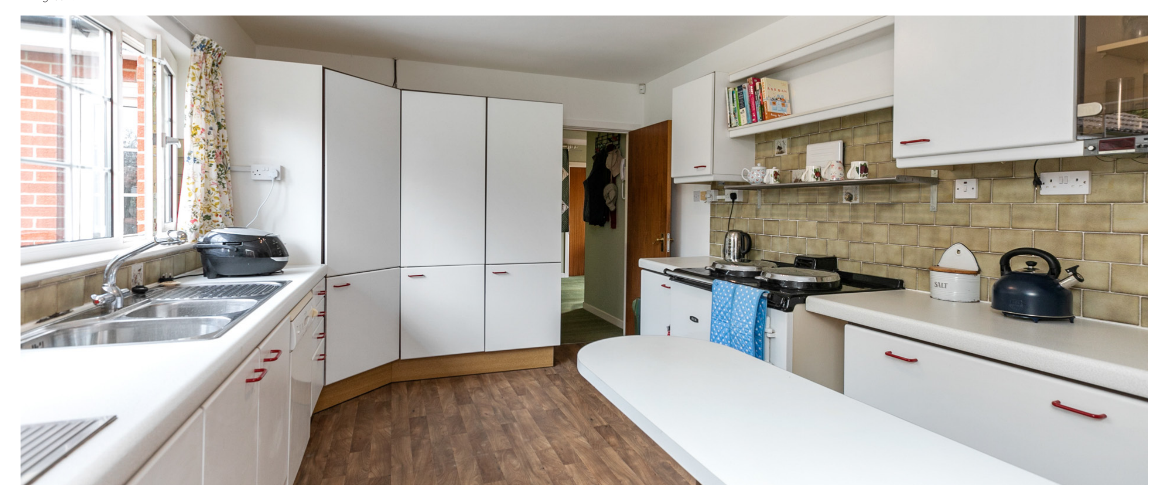
Kitchen with feature Aga.