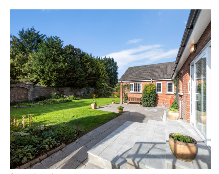
Rear garden and patio area