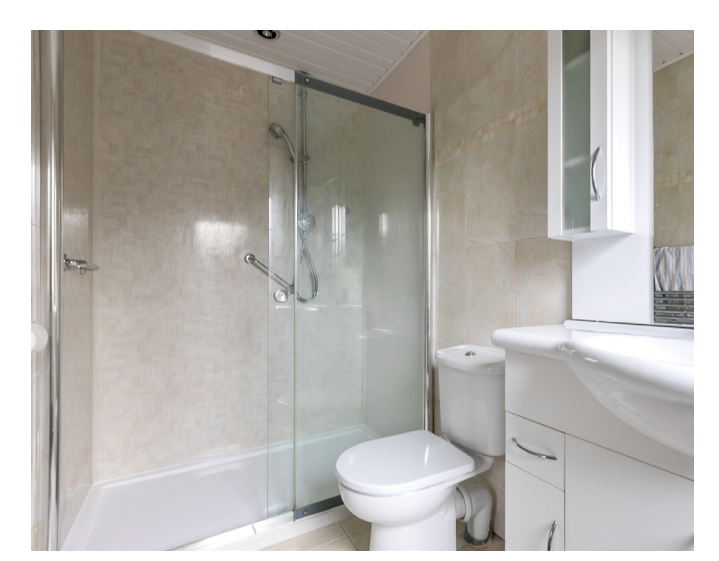
En suite shower room

Large, flagged patio area to the rear to enjoy the complete