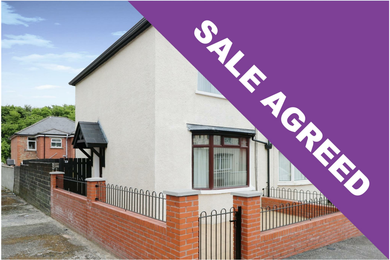
23 Northwood Parade, Belfast, BT15 3QH