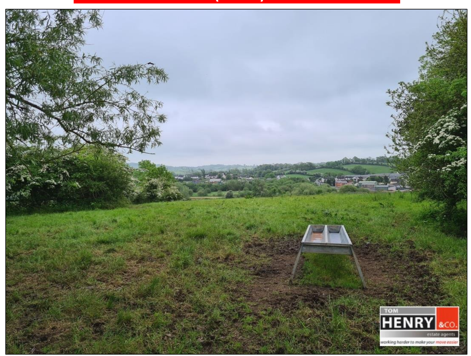
APPROX. 3.1 ACRES WITHIN THE SETTLEMENT LIMIT – CENTRAL & POPULAR LOCATION