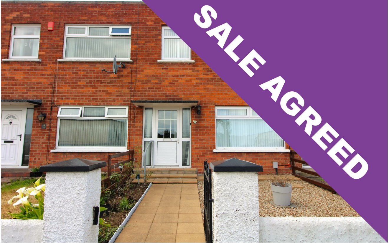
58 Kings Avenue, Newtownabbey, BT37 0DE