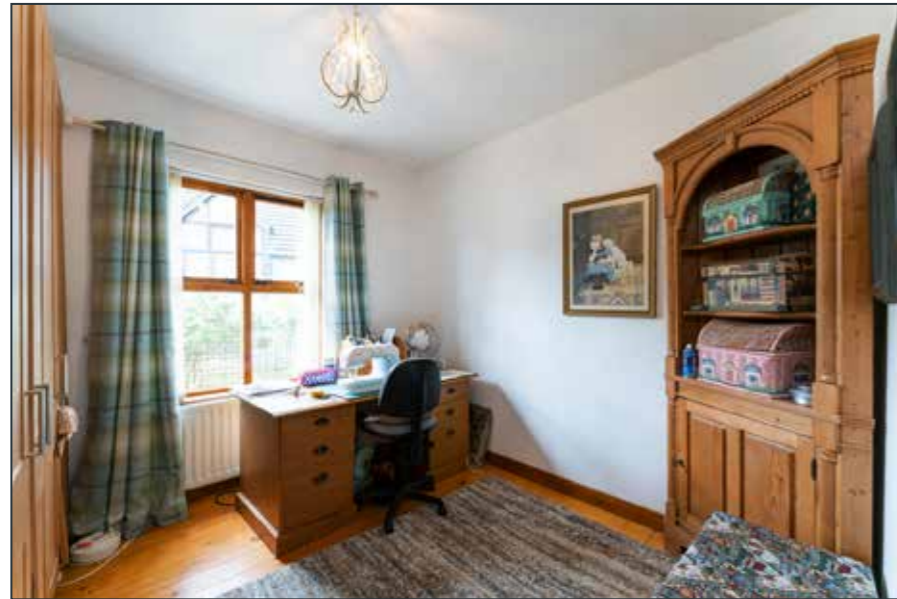
BEDROOM (3): 9' 10" x 9' 9" (3m x 2.97m) Range of built in robes, polished wooden floorboards.