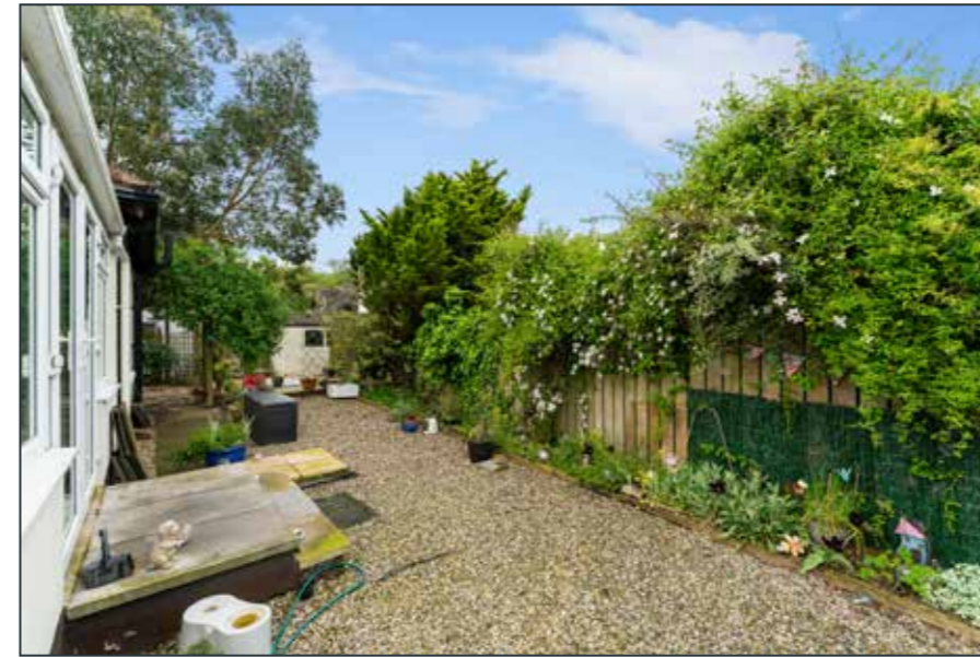
OUTSIDE Gardens to front, side and rear laid out in low maintenance gravel areas, feature timber deck, paved patio, trees, shrubs, bushes and plants, paved path, trellising and fencing. Boiler house with oil fired boiler (installed March 22), oil storage tank, outside light, outside water tap, garden shed. Good sized brick paved driveway to side of property.