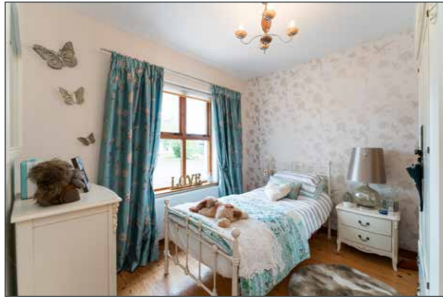
BEDROOM (2): 9' 10" x 9' 8" (3m x 2.95m) Polished wooden floorboards.