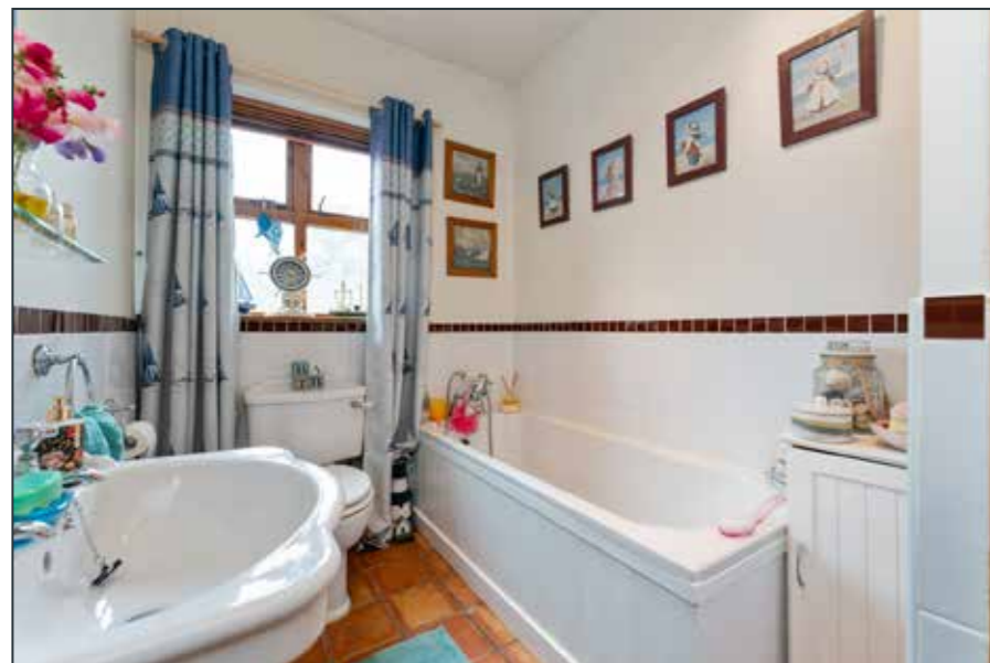
DELUXE BATHROOM: White suite comprising: Panelled bath with mixer taps and telephone hand shower over, pedestal wash hand basin, low flush WC, wall tiling, ceramic tiled floor, extractor fan, concealed hotpress with copper cylinder and immersion heater.