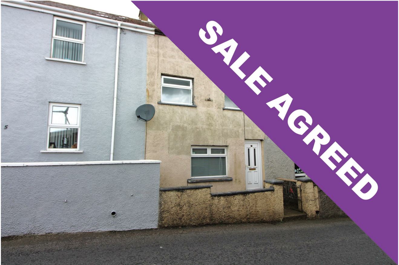
3 Craigarogan Road, Newtownabbey, BT36 4RA