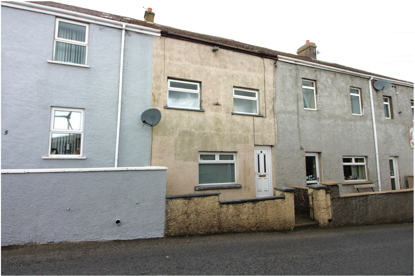
3 Craigarogan Road, Newtownabbey, BT36 4RA