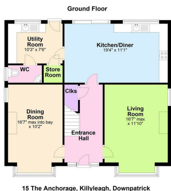
15 The Anchorage, Killyleagh, Downpatrick