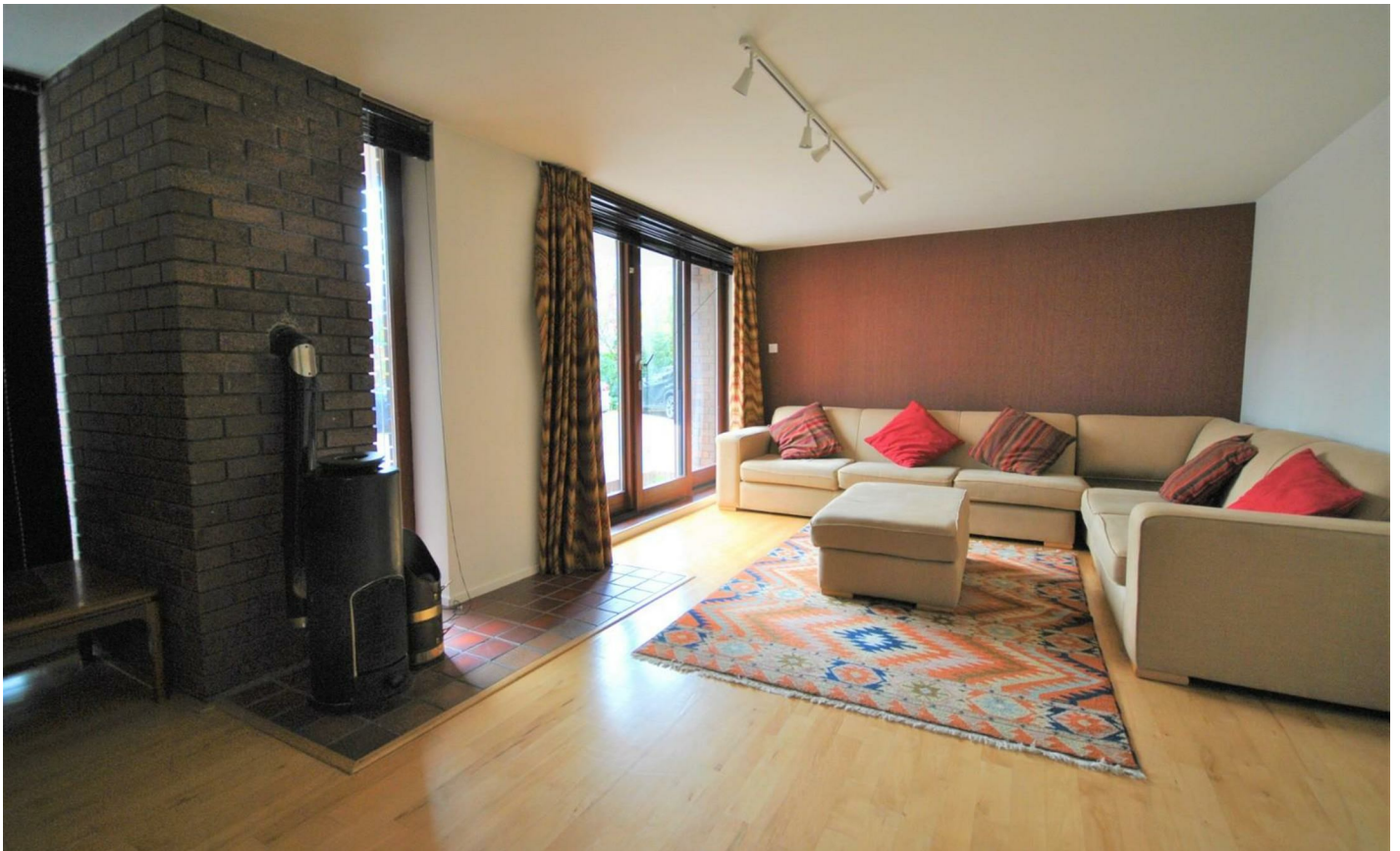
TYPE ROOM NAME HERE

Properties in this desirable area generate considerable interest, early viewing is recommended.