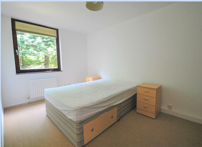
TYPE ROOM NAME HERE