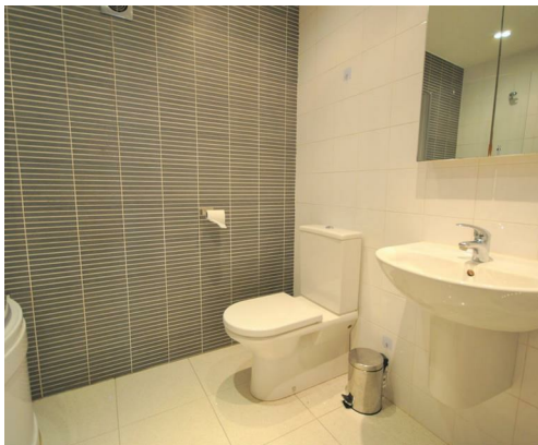
TYPE ROOM NAME HERE