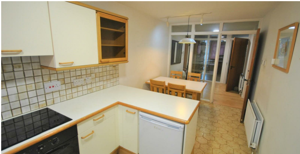
TYPE ROOM NAME HERE