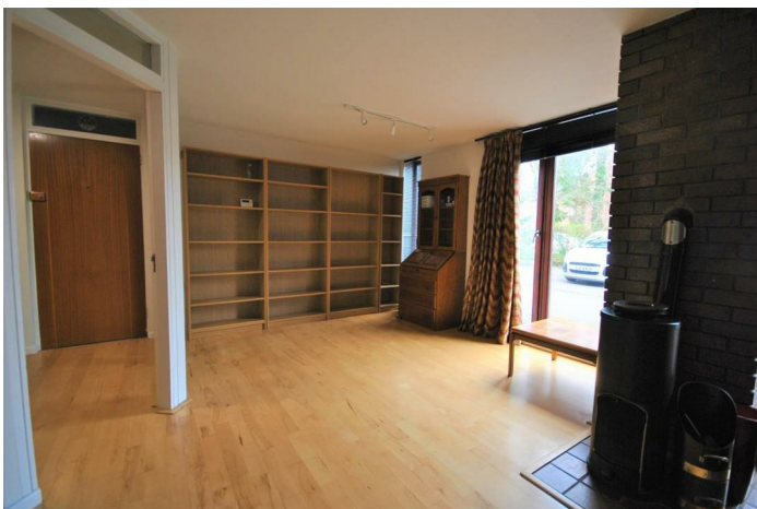
TYPE ROOM NAME HERE