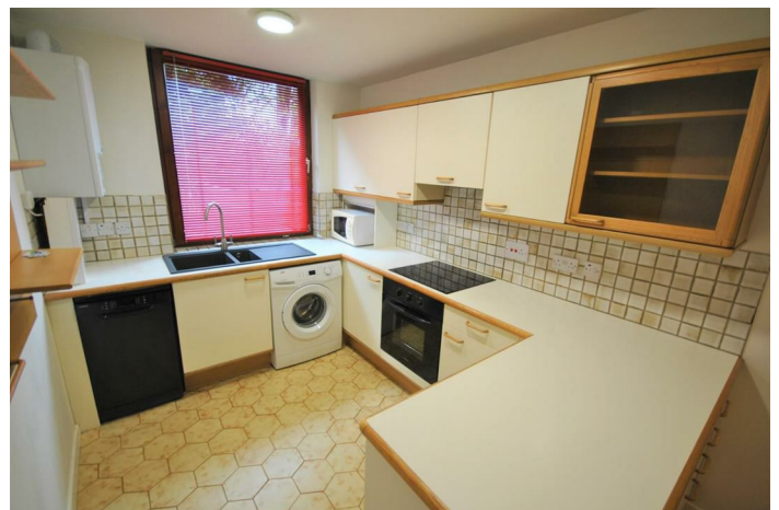
TYPE ROOM NAME HERE