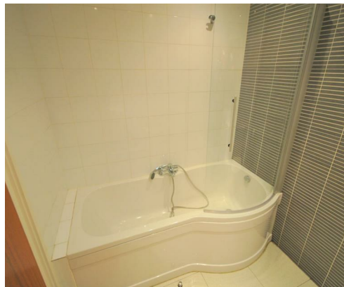
TYPE ROOM NAME HERE