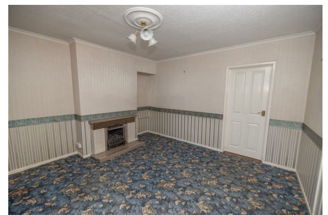
7 Rosconnor Terrace Rathfriland, Newry, BT34 5DJ