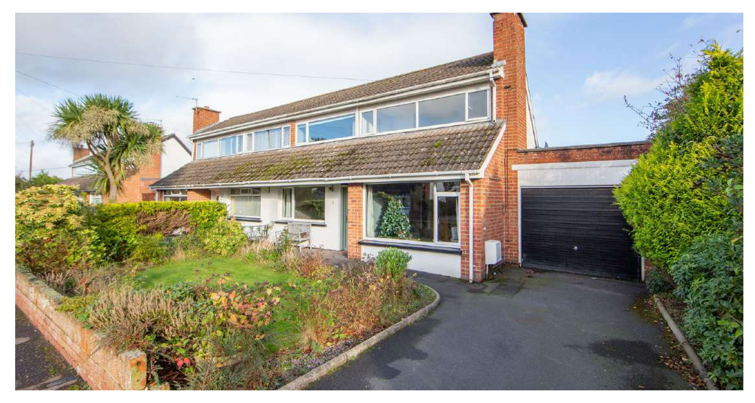
SEMI DETACHED | 3 ⊨ | 1 ≒ | 1 ⊟

This is an ideal opportunity to purchase an semi detached property tucked away in a quiet cul-de-sac position providing excellent convenience to Donaghadee's thriving town centre as well as Newtownards and Bangor