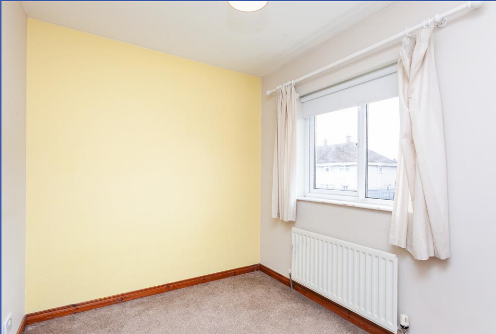
BEDROOM 13' 7" x 8' 0" (4.14m x 2.44m) (at widest points)