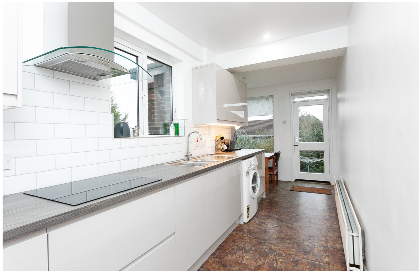
Contemporary Kitchen with good range of cupboards