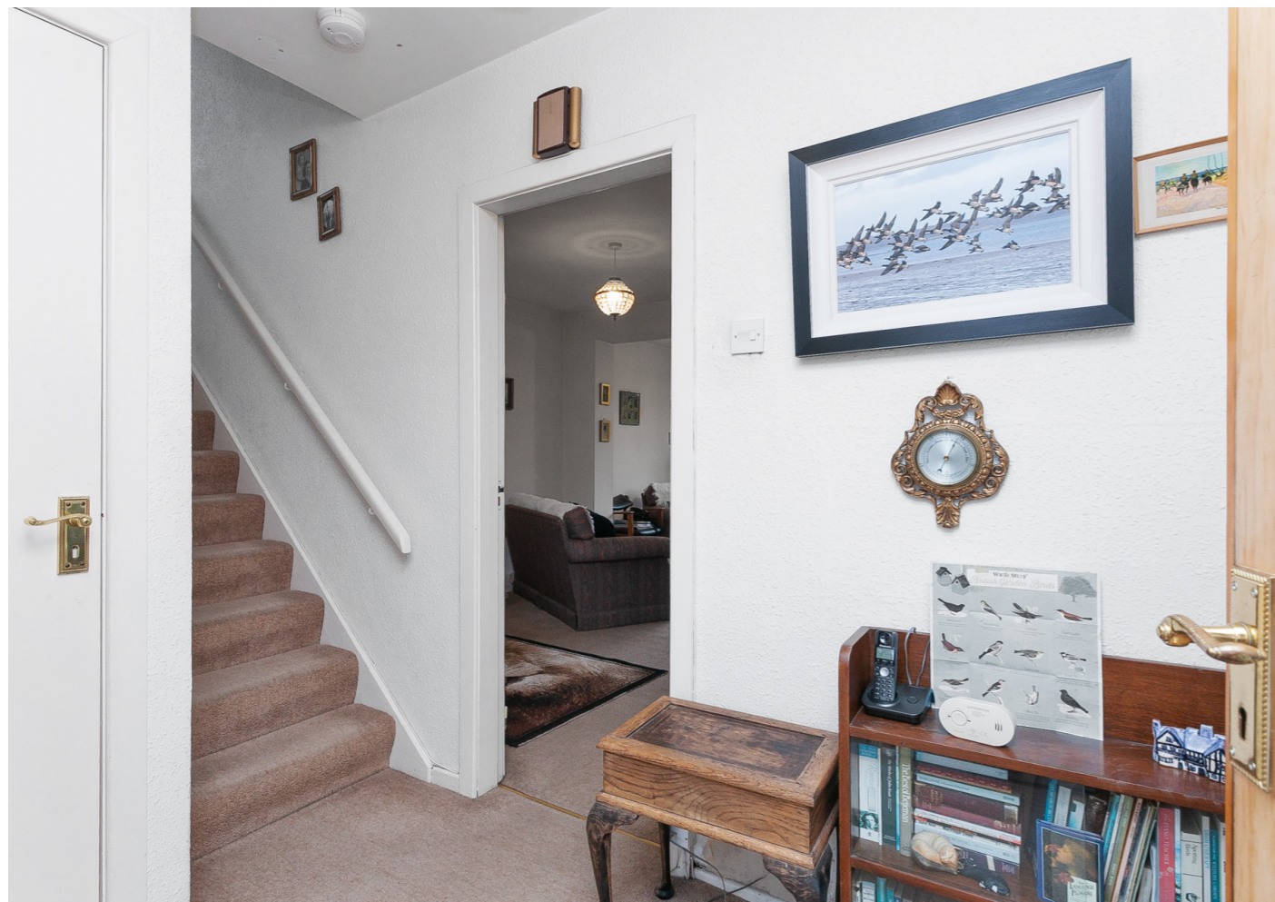
Entrance hall EXPERIENCE | EXPERTISE | RESULTS