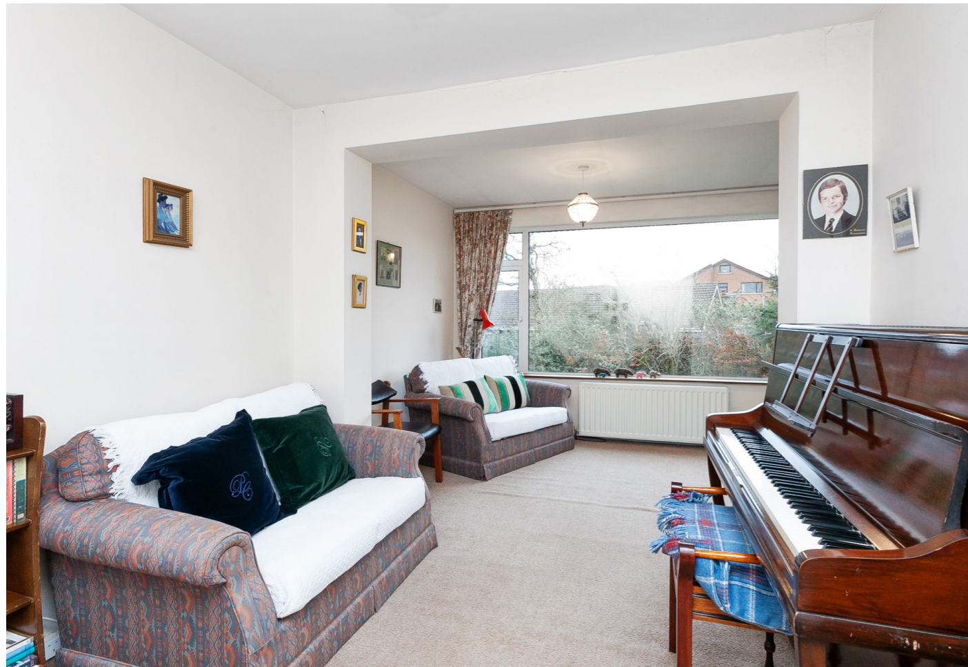
Living room open to Sitting room