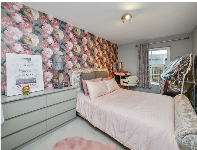
Bedroom 1 14'9" x 8'7" (4.51m x 2.64m)

Modern fitted kitchen with a selection of upper and lower level units with formica worktops, stainless steel sink and drainer unit, integrated electric oven with 4 ring gas hob, fridge freezer and plumbed for washing machine. Part tiles walls and tiled flooring.