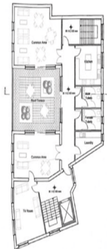
Proposed Third Floor Plan Scale 1:100