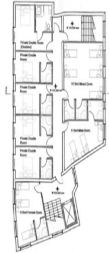
Proposed First Floor Plan Scale 1:100