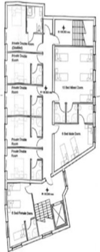
Proposed Second Floor Plan Scale 1:100