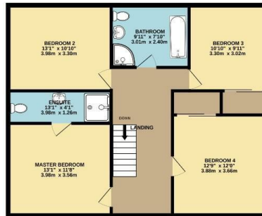
1ST FLOOR 874 sq.ft. (81.2 sq.m.) approx.