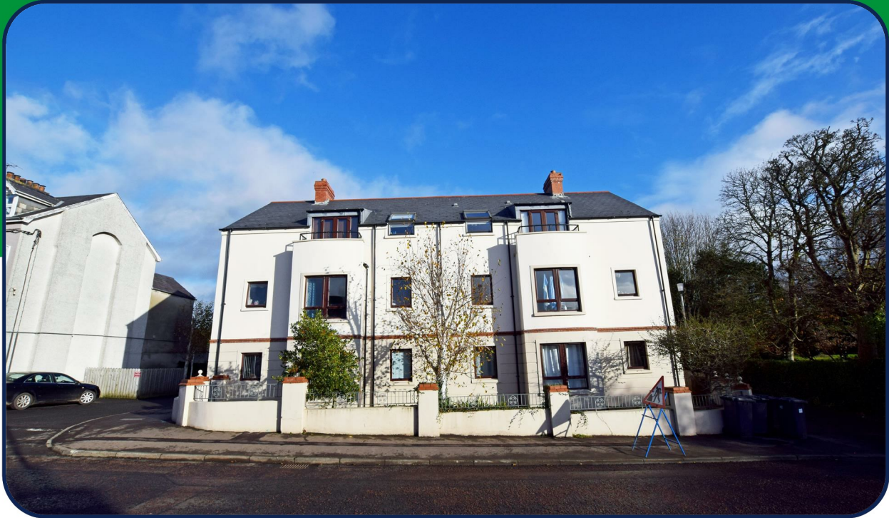
Apt 8 Bellevue Court, Coleraine, BT52 1RY