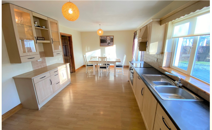
No 5 Cois Locha Doohamlet, Castleblayney,Co. Monaghan A75KC82

All Principle services including mains water and drainage, local mains supply . Telephone and broadband are available and previously connected and used by last tenant.