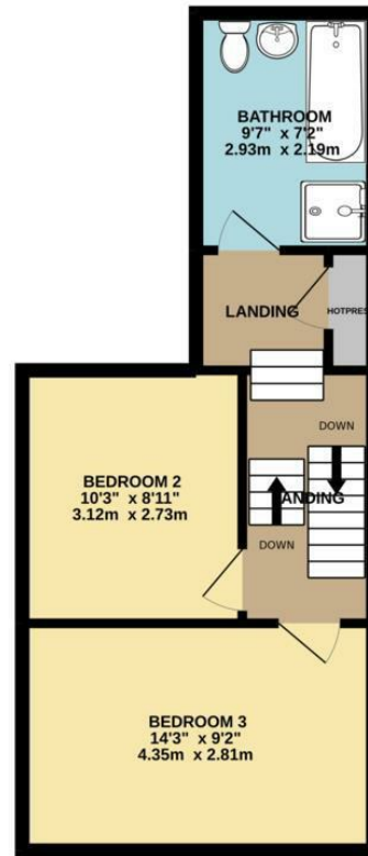
1ST FLOOR 382 sq.ft. (35.5 sq.m.) approx.