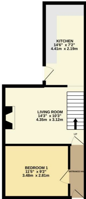
GROUND FLOOR 375 sq.ft. (34.8 sq.m.) approx.