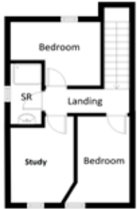
2b Rugby Avenue, Belfast (Upper Floor) Plans for illustrative Purposes Only