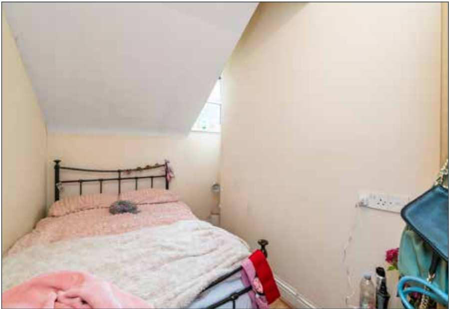
SECOND FLOOR BEDROOM (2): 10' 10" x 7' 7" (3.3m x 2.3m)