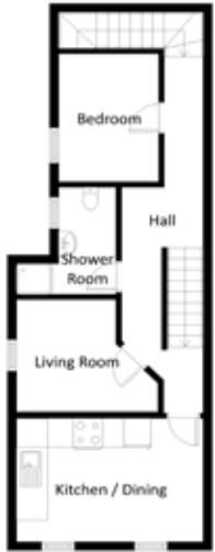
2b Rugby Avenue, Belfast (Lower Floor) Plans for illustrative Purposes Only