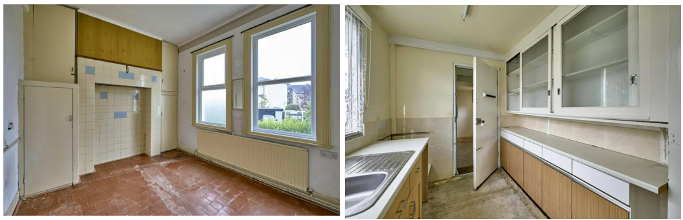
UTILITY ROOM: 12' 4" x 6' 9" (3.76m x 2.06m) Sink unit with double drainer, Worcester gas fired boiler, door to outside courtyard.

KITCHEN: 11' 9" x 7' 7" (3.58m x 2.31m) Range of units, stainless steel sink unit with mixer tap, plumbed for dishwasher, space for fridge.