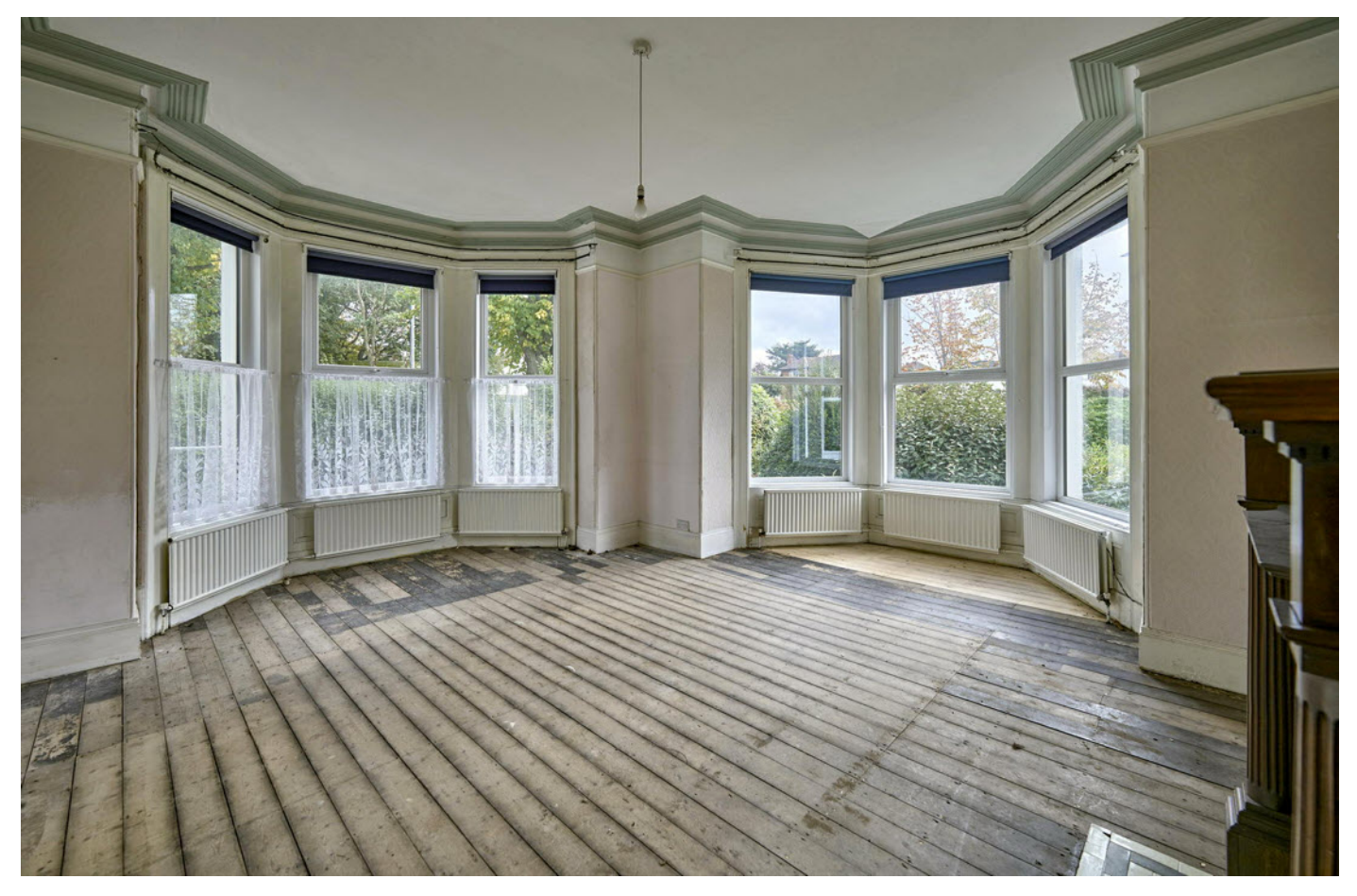
DRAWING ROOM: 25' 3" x 15' 5" (7.7m x 4.7m) Original ornate fireplace with cast iron inset, hearth and open fire.

LOUNGE: 19' 4" x 19' 3" (5.89m x 5.87m) (into side bay). Ornate fireplace with tiled inset and hearth.