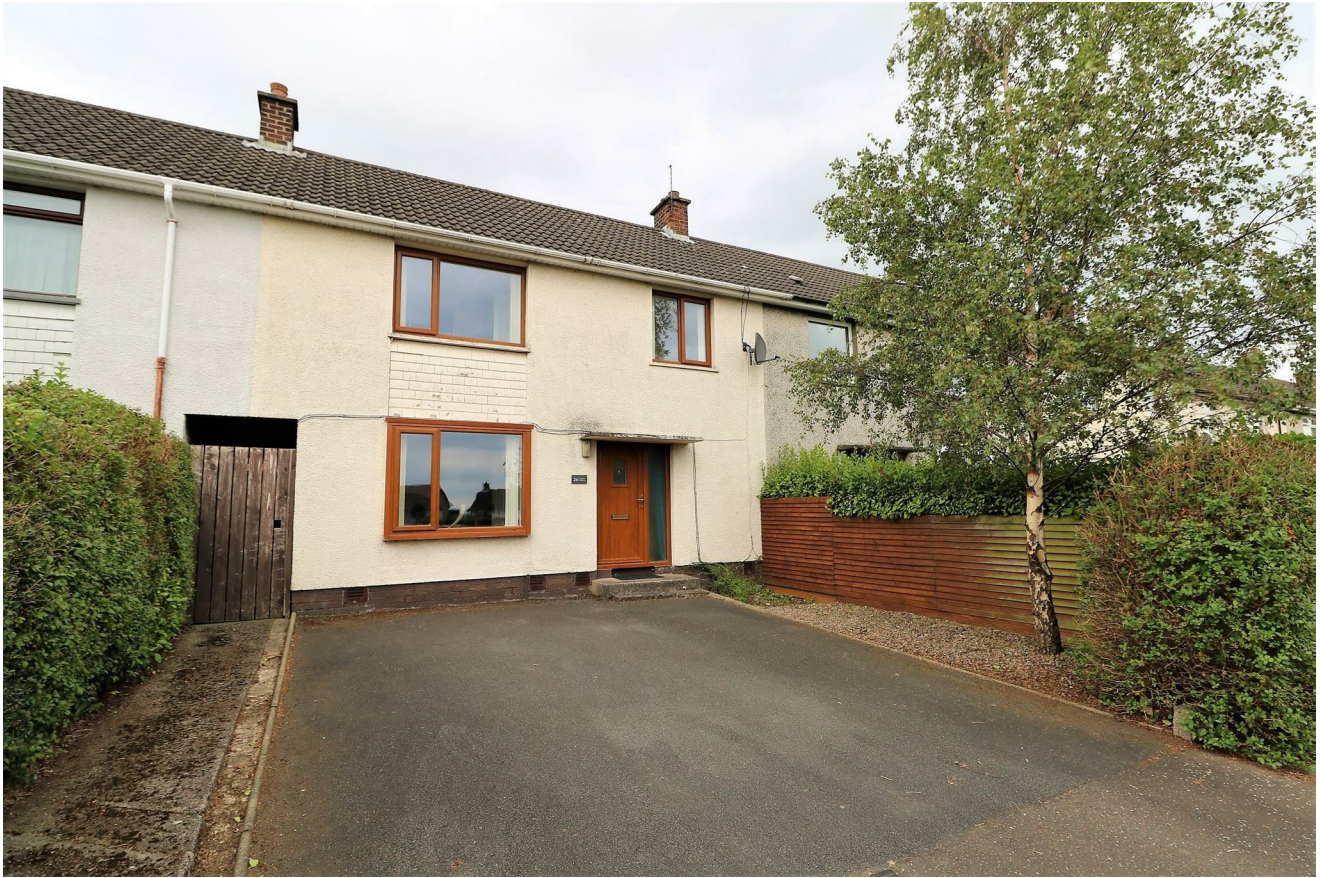
26 Glanroy Crescent, Newtownabbey, BT37 9JZ