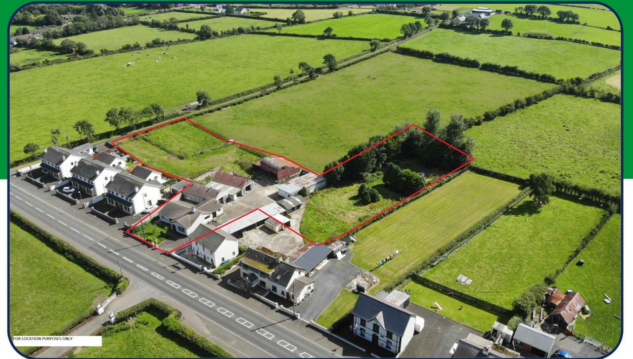
Development Site for 12 dwellings at Kilraughts Road, Ballymoney, BT59 7LL