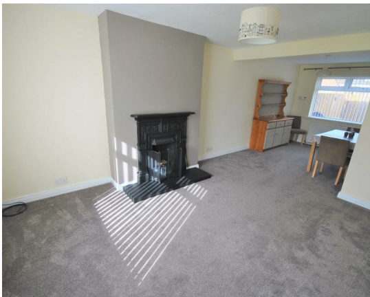
LOUNGE / DINING ROOM