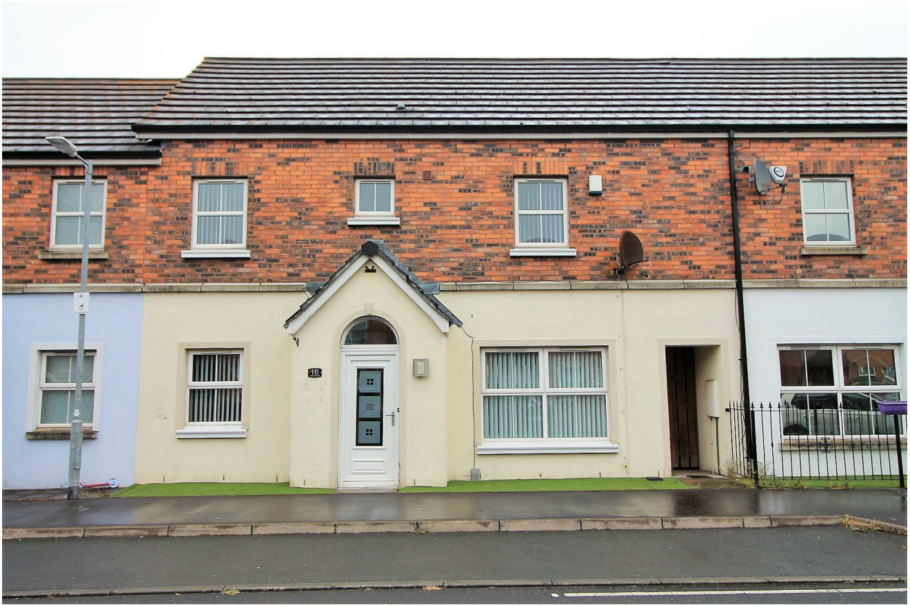
16 Arosa Parade, Belfast, BT15 3JF