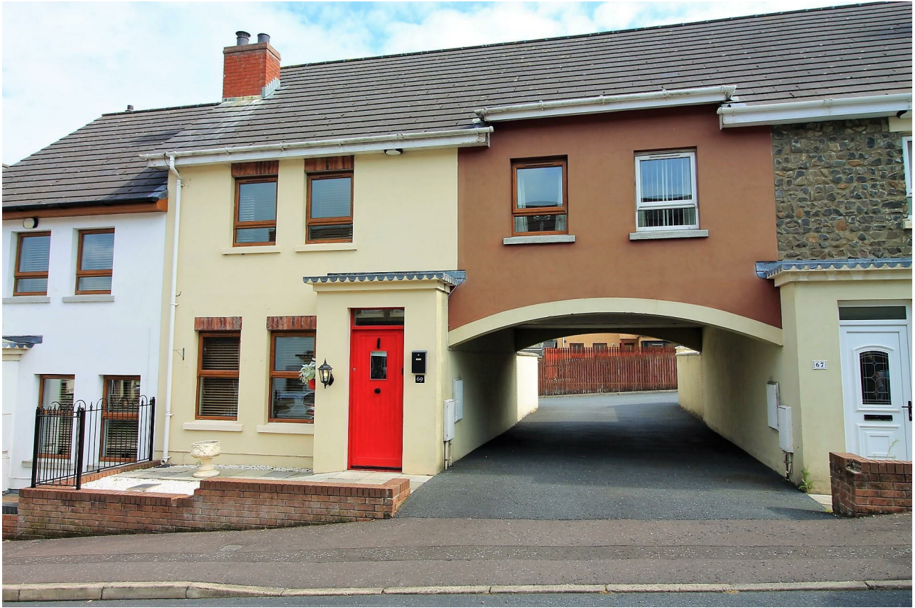
69 Alderley Place, Newtownabbey, BT36 7SJ