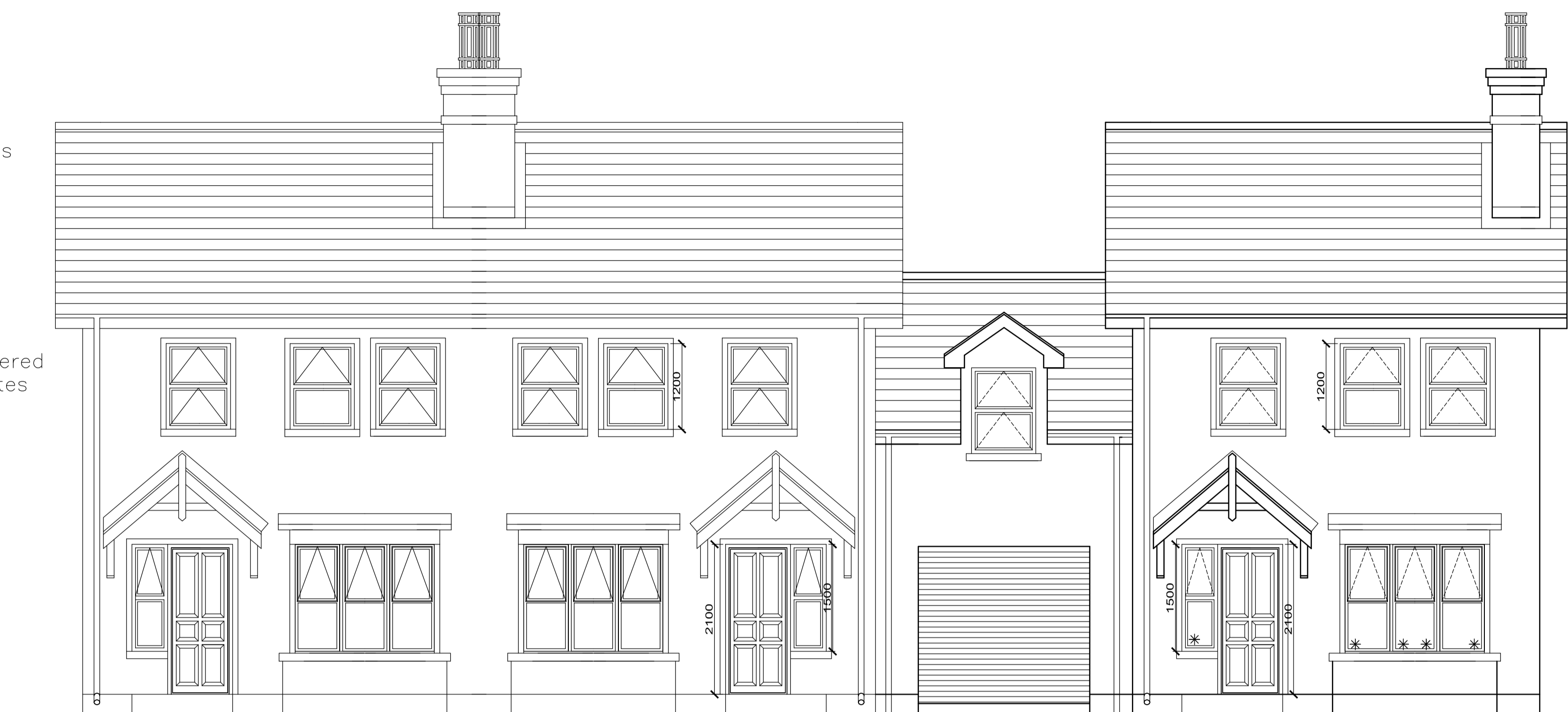
Front Elevation 1/50.