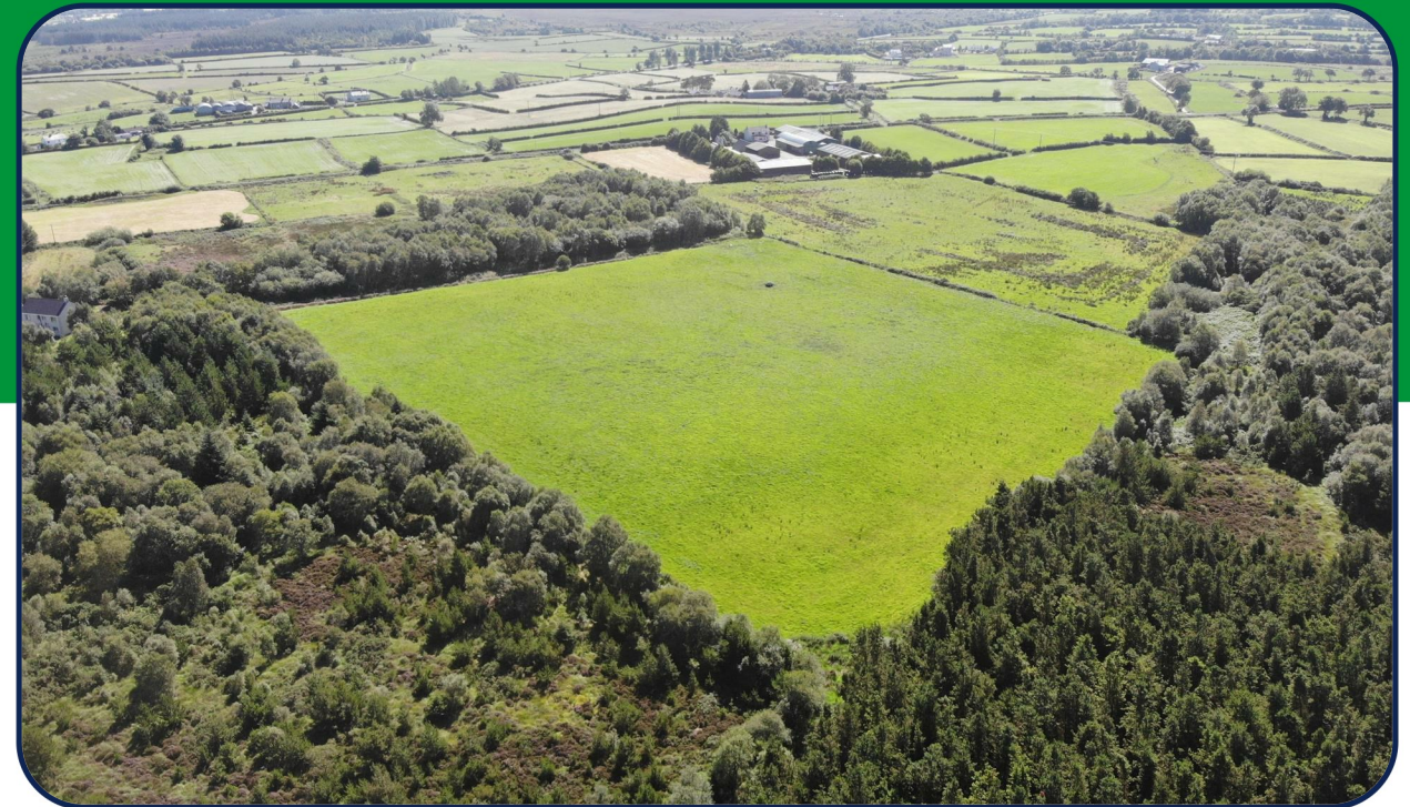
Approx. 9.16 acres of Land at Heagles Road, Ballybogey, Ballymoney, BT59 0N7