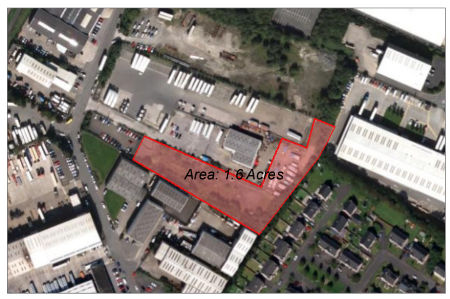
For illustration purposes only.